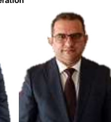
H.E. Tigran Khachatryan, Minister of Economy, Republic of Armenia