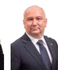
H.E. Dr. Nenad Popovic, Minister of Innovation and Technological Development, Republic of Serbia