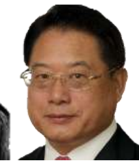
H.E. Li Yong DG, UNIDO