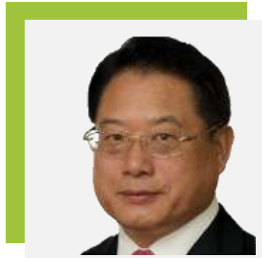
His Excellency Li Yong Director General

United Nations Industrial Development Organization