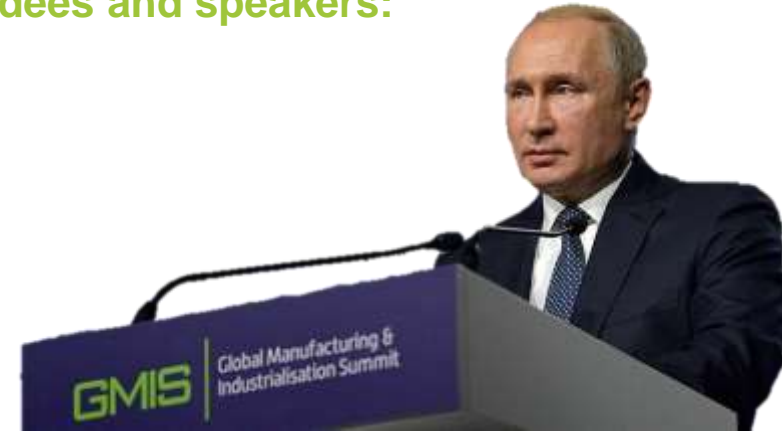
Russian President Vladimir Putin gives a speech during the Global Manufacturing & Industrialisation Summit (GMIS) in Yekaterinburg on July 9, 2019