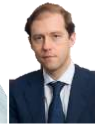
H.E. Denis Manturov Minister of Industry and Trade of the Russian Federation