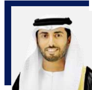
His Excellency Suhail Al Mazroui Minister of Energy and Industry United Arab Emirates

UNITED NATIONS INDUSTRIAL DEVELOPMENT ORGANIZATION