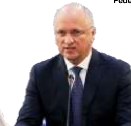
H.E. Roman Sklyar, Minister of Industry and Infrastructure Development, Republic of Kazakhstan