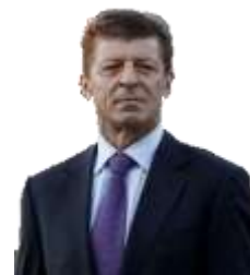
H.E. Dmitry Kozak Deputy Prime Minister of the Russian Federation