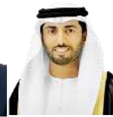
H.E. Suhail Al Mazroui Minister of Energy and Industry, UAE