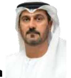
H.E. Eng. Hussain bin Ibrahim Al Hammadi, Minister of Education, UAE