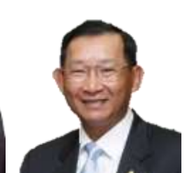
H.E. Cham Prasidh, Senior Minister of Industry and Handicrafts, Cambodia