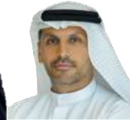
H.E. Khaldoon Al Mubarak Group CEO of Mubadala