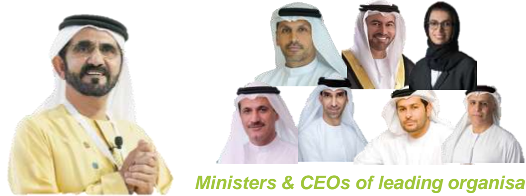
Ministers & CEOs of leading organisations